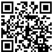
Raffle box - 50/50 and WestJet

You can also access through our QR Codes: