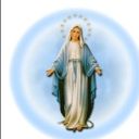
Legion of Mary