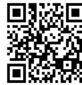
Grad Show Tickets